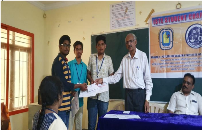
I Prize winners in Technical Quiz at Engineers' day celebrations-2019