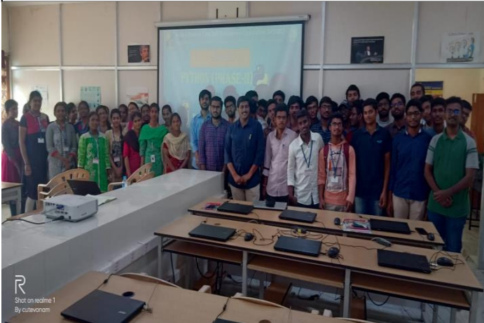
Three day Workshop on “Python” Phase-II in association with APSSDC for III Year CSE students