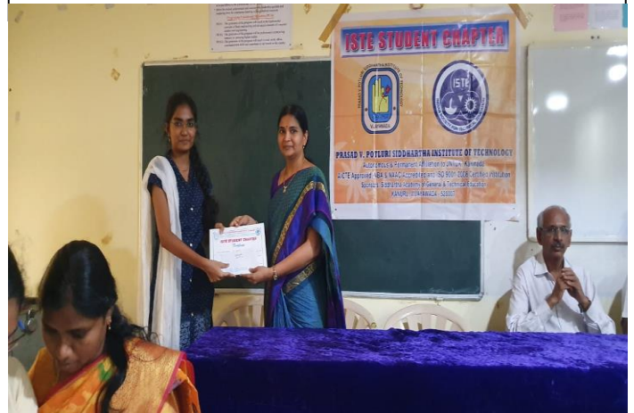
I Prize winner in Elocution at Engineers' day celebrations-2019