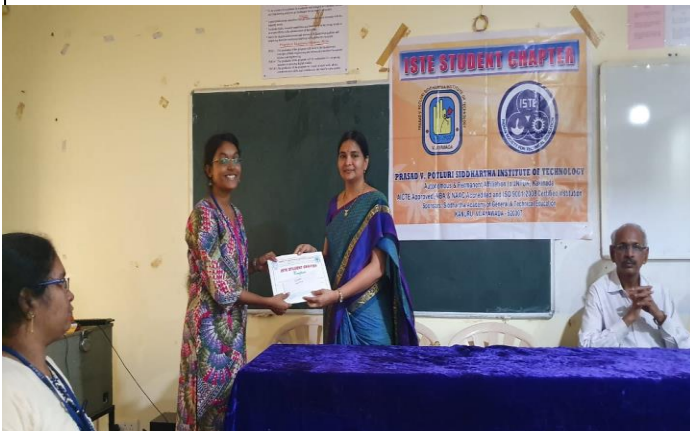
II Prize winner in Elocution at Engineers' day celebrations-2019