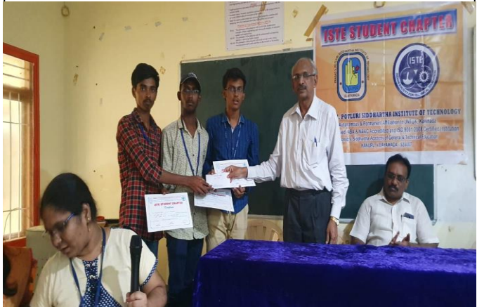
II Prize winners in Technical Quiz at Engineers' day celebrations-2019