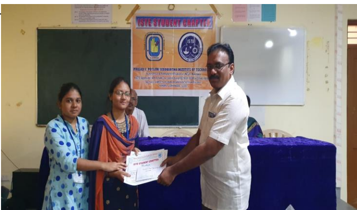
I Prize winners in PPT at Engineers' day celebrations-2019