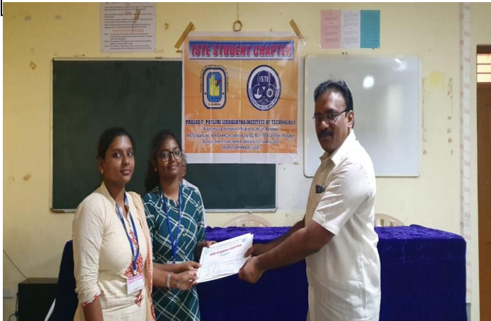
III Prize winners in PPT at Engineers' day celebrations-2019